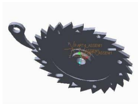
Figure 2. Three dimensional model of Ratchet & Pawl Mechanism.

As the vehicle is in neutral position, the pawl engaged the ratchet and the vehicle did not move in backward direction. So the hand brakes need not to be applied. When the vehicle is in moving condition, the engagement between the ratchet and pawl is detached. V. DESIGN OF RATCHET AND PAWL The mechanism is designed for the loading conditions of MARUTI Swift DZIRE. The circumference of the front drive shaft of this car is measured and the diameter is determined as 23.89mm. The weight and Torque of the MARUTI SWIFT DZIRE car are 1060 Kg and 190N-m, respectively. SLOPE OF THE ROAD: The steepest road in India is ZOJI PASS in KASHMIR and the angle of inclination of the road is found to be 21.80 degrees. The percentage slope there is about 40 %. The material considered for ratchet and pawl are