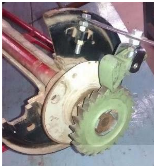
Figure 4: Anti Roll Back Mechanism

The fabricated mechanism is fitted in drive shaft for testing experimentally to check whether the functionality has been achieved (Figure 5). The hand driven lever is turned in forward direction, similar to forward motion of the car, the pawl does not stop the ratchet to rotate. The hand lever is turned in opposite direction similar to the reverse motion of the car in the hill road, and the pawl stops the rotation of the ratchet. So, the drive shaft and the wheels did not rotate. Therefore the reverse motion of the wheels is arrested. The same can be achieved if this model is fitted in the car. This will be the case while fitting this mechanism in the drive shaft of the car. When it has been done the car cannot move in reverse direction in the slope as the pawl locks the ratchet.