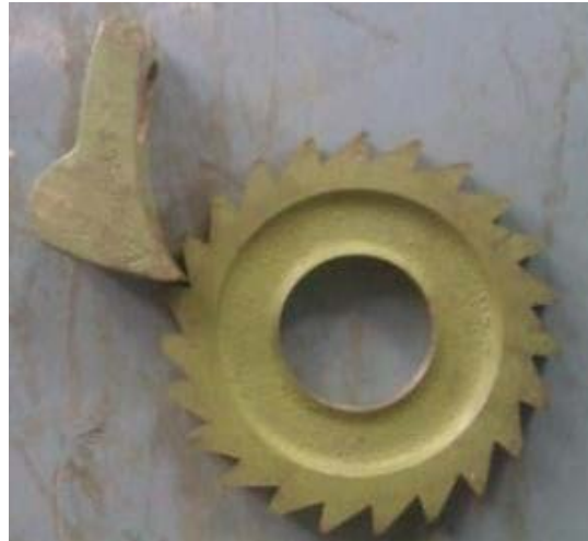
Figure 3: Fabricated Ratchet and Pawl Mechanism VIANTI ROLL BACK MECHANISM

The fabricated Ratchet and Pawl mechanism is shown in Figure3.